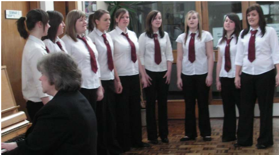
Beath High School Choir

Over 60 delegates from around Scotland met for another excellent day finding out how speaking and listening can be integrated into the curriculum through collaborative learning. We were welcomed into Auchterderran Centre with refreshments and by the harmonious and varied repertoire of popular songs sung by the Girls Senior Choir from Beath High School who were the recent winners at the Fife Music Festival.